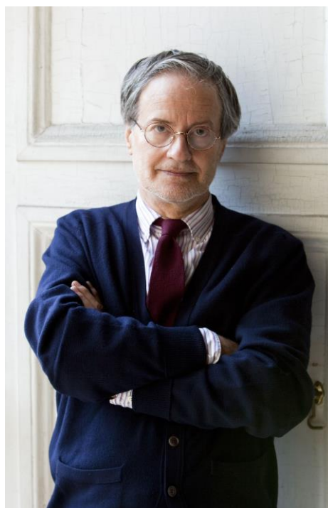
Giulio Paolini Courtesy Fondazione Giulio e Anna Paolini, Turin

Giulio Paolini was born on 5 November 1940 in Genoa and lives in Turin.