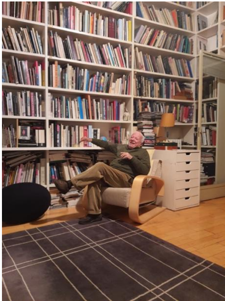
Achille Bonito Oliva in his studio in Rome, 2021