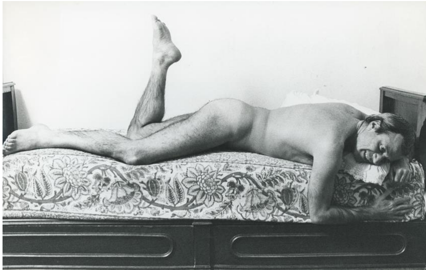
Achille Bonito Oliva.