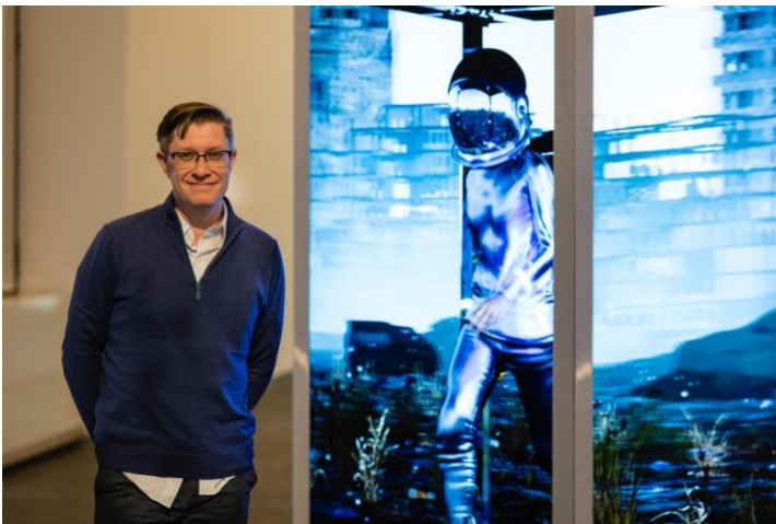
Beeple, 2022

The event will be followed by the presentation and book signing of the volume Beeple: Everyday, the First 5000 Days (Abrams, New York, 2023), the first monograph dedicated to the artist, at the Castello di Rivoli Bookshop.